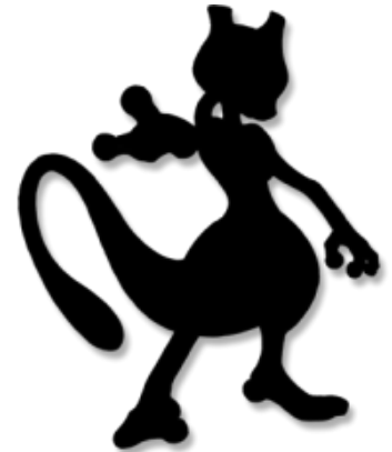
Could be anywhere!